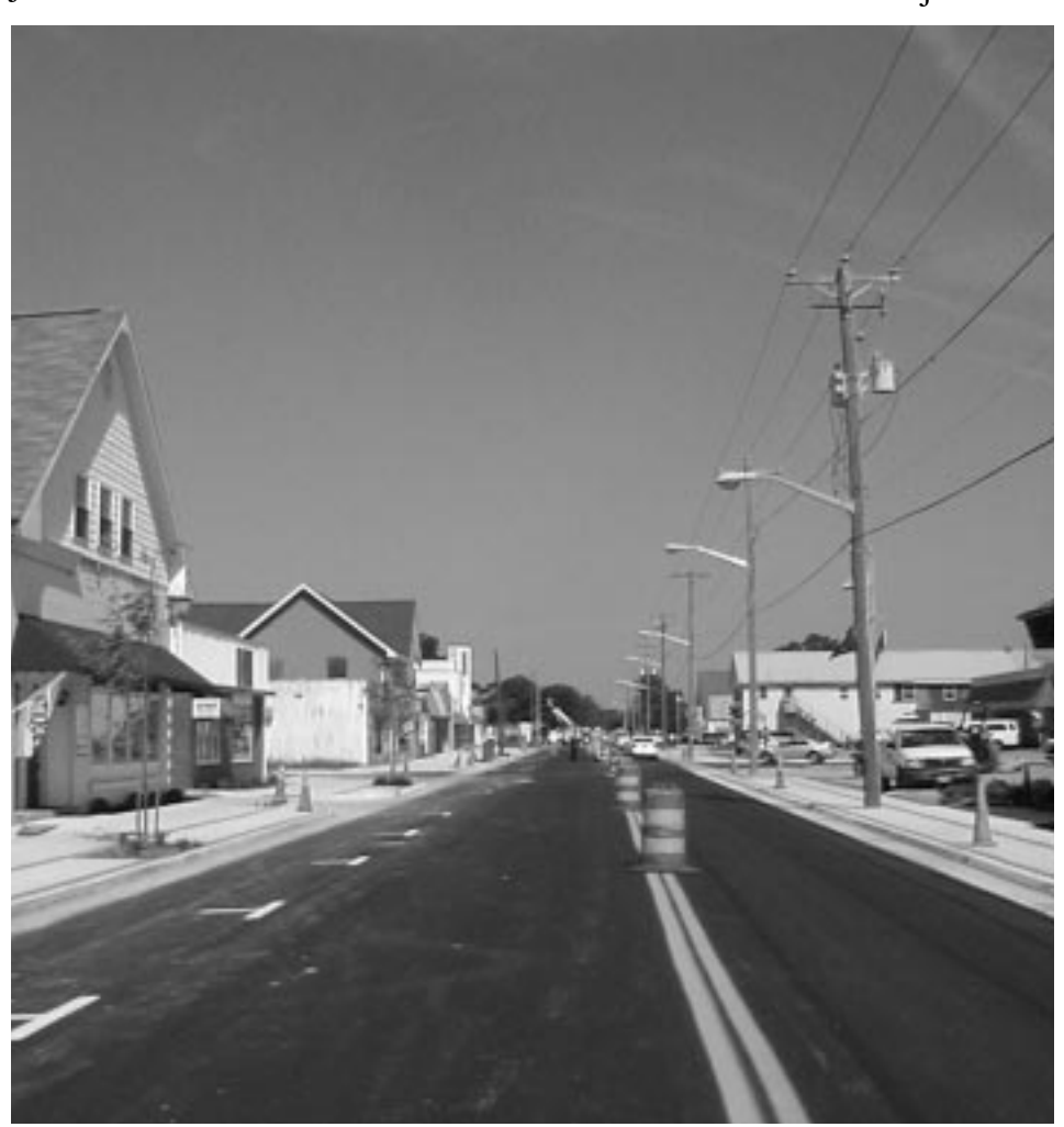
Crews Remove Downtown Exmore's Utility Poles

This work is part of the Exmore Downtown Revitilization Project which