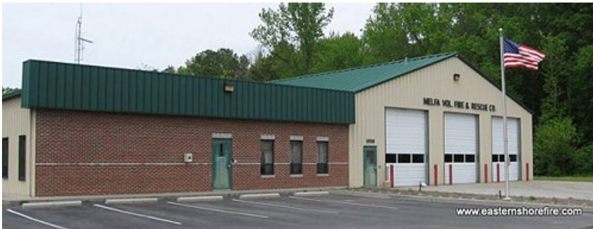
Figure 1 : Melfa Volunteer Fire and Rescue Company building on Hatton Avenue includes 3 bays, a community room, bunk rooms, restrooms, station watch room, laundry room, offices, & storage areas.

The Melfa Volunteer Fire and Rescue Company was organized in May 1950 in the aftermath of the "Easter Sunday Fire." Presently, the Fire Company operates a fleet of six apparatus, including two advanced life support ambulances, two engines, a 2,500-gallon tanker, and a brush truck. Additionally, there are three trailers as well as a support/tow vehicle operated by the Hazmat Team and the Eastern Shore C.E.R.T. Disaster Response trailer that are kept on the station's property. The station has three bays and was built in 2002. In addition to serving Melfa, the Melfa Volunteer Fire and Rescue Company serves portions of Bobtown, Boston, Hacks Neck, Harborton, Keller, Texacotown, Savageville, and various outlying areas.