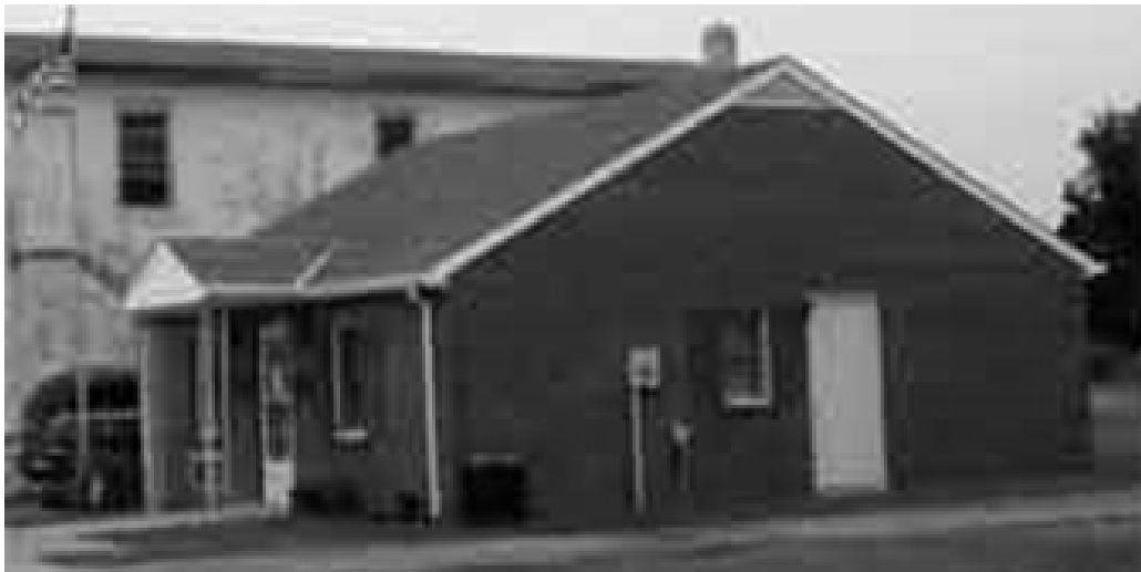
Figure 2: Onley Town Office & Police Department. Photo by Ann Devletian, 2003

The Town has purchased land adjacent to the existing Town Hall to construct a new Town Office. Once constructed, the Police Department will be the sole occupant in the existing building. The Town is interested in constructing the new facility to more stringent building codes that would lessen the risk of flooding and wind damage.