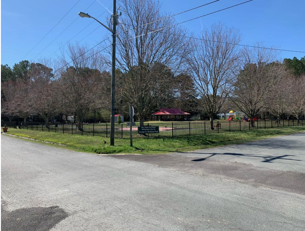
Figure 1: George M. McMath Town Park.