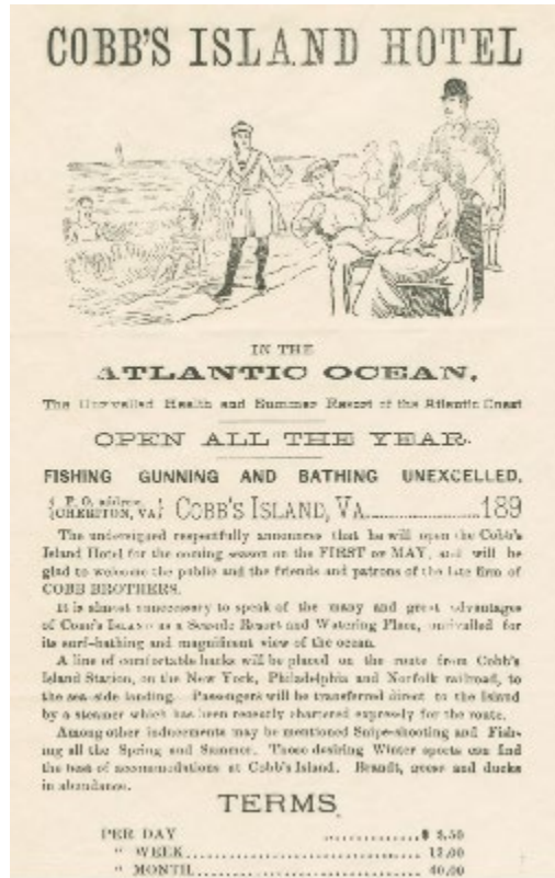
Figure 1: Advertisement for Cobb Island Hotel

Standing on the pristine beach of Cobb Island in Northampton County, one would never know that the now-tranquil barrier island was a bustling recreational center in its prime where a harpist once entertained guests in the island’s grand resort hotel (Figure 1: Advertisement for Cobb’s Island Hotel).