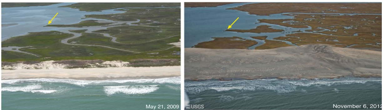
Figure 5: Aerial photographs of a section of Assateague Island before and after Hurricane Sandy.

Because the Eastern Shore barrier islands are largely in their natural states and without erosion control mechanisms, the process of rollover is readily observed. In Figure 5, images of a section of Assateague Island, taken before and after Hurricane Sandy, illustrate how waves washing over the island carried sand toward the mainland. This phenomenon provides critical width for islands and establishes a back-barrier platform which the island can continue to roll onto, thereby increasing the long-term viability of the island.