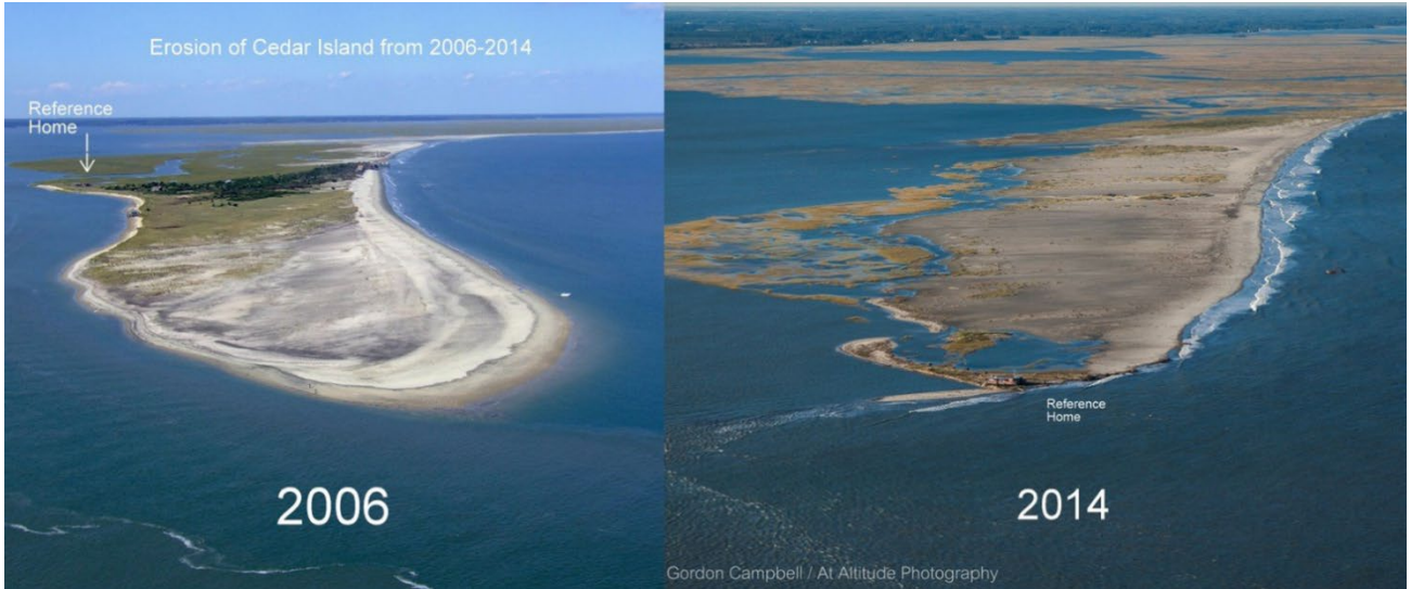
Figure 3: Changes to the southern end of Cedar Island, 2006-2014.

Because the Eastern Shore barrier islands are largely in their natural states and without erosion control mechanisms, the process of rollover is readily observed. In Figure 5, images of a section of Assateague Island, taken before and after Hurricane Sandy, illustrate how waves washing over the island carried sand toward the mainland. This phenomenon provides critical width for islands and establishes a back-barrier platform which the island can continue to roll onto, thereby increasing the long-term viability of the island.