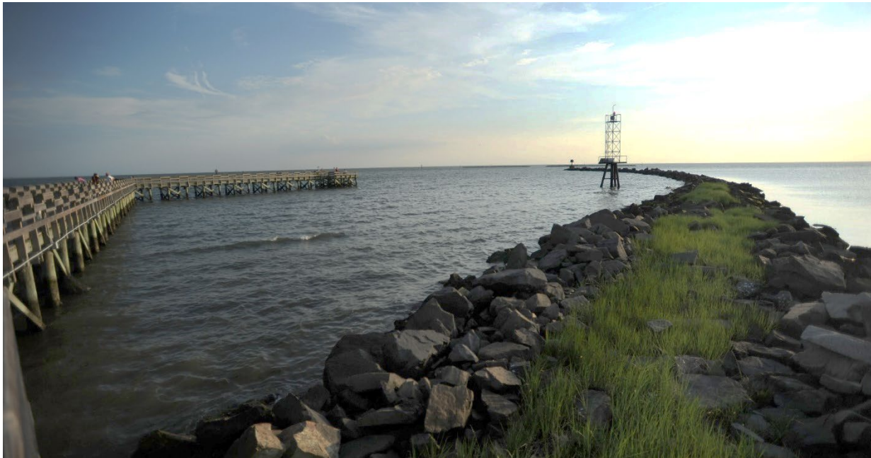
Figure 4: Jetty at Cape Charles Harbor. Photo Credit: Jay Diem, Eastern Shore News. Used with permission.

Groins and jetties interrupt the natural drift of sand, causing sediment to build, or accrete, on the up-drift side of the structures. These structures accelerate erosion on the immediate down-drift side because the area is robbed of the natural sediment it would have received from longshore drift (Barnard, T., VIMS Self-Taught Education Unit, Coastal Shoreline Defense Structures). The VIMS Self-Taught unit on Coastal Shoreline Defense Structures contains additional information on groins and jetties.