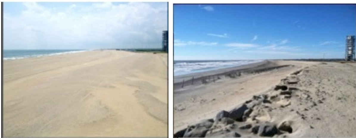
Figure 7: Beach Erosion at Wallops Flight Facility. Left: The completed beach nourishment project at WFF in August 2012. Right: The same stretch of beach is extensively eroded less than three months later, following Hurricane Sandy.

In February 2020, the U.S. Army Corps of Engineers awarded a $23.7 million contract to a Florida-based company to conduct beach renourishment at Wallops Island, including “construction of breakwaters and placing 1.3 million cubic yards of sand along a four-mile stretch of the facility’s waterfront.” (US Army Corps of Engineers, Norfolk District Website, 2020).