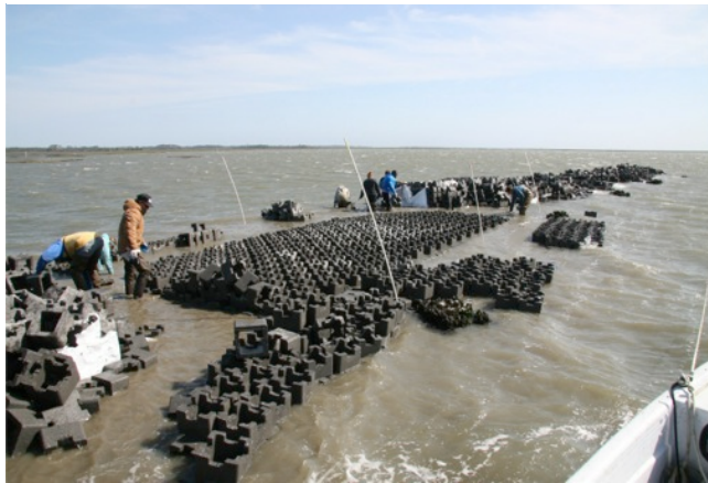
Figure 12: Oyster Reef under Construction Photo Credit: © Bowdoin Lusk/ The Nature Conservancy. Used with permission.