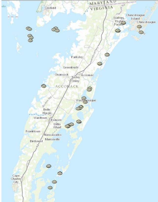
Figure 11: Locations of Manually-Constructed Oyster Reefs in Waters off Virginia's Eastern Shore.