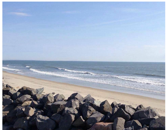
Figure 5: Revetment at the beach of Wallops Flight Facility.

Figure 8 below shows the locations of all type of shoreline erosion control structures for the northern two-thirds of Northampton County, including bulkheads. As increasing numbers of property owners install these structures, and with lifespans of 20-25 years, long-term financial commitments will be needed to maintain them (Barnard, Thomas, VIMS Self-Taught Education Unit, Coastal Shoreline Defense Structures).