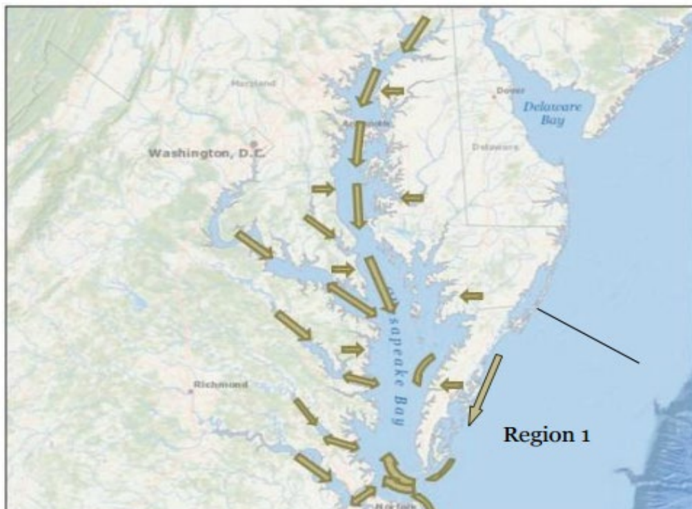
Figure 2: Net sediment transport pathways for Chesapeake Bay and Atlantic area off the Virginia Coast.

The general pattern of transport in the Eastern Shore area is southward along the Atlantic Coastline into the Chesapeake, and southward within the bay to the lower Chesapeake where it is deposited either in the bay or tributaries of lower bay rivers, as shown in Figure 2 (USACE, 2015).