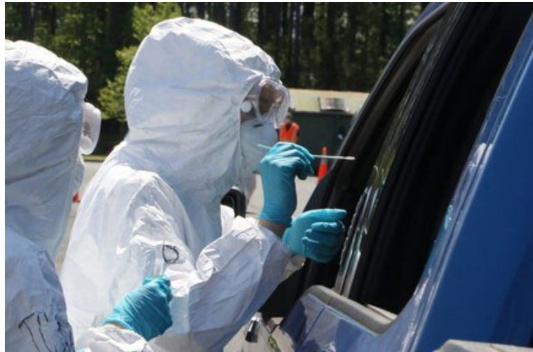
Figure 3 U.S. National Guard.

These data sets can demonstrate how serious a disease is to the individual and using the example of the annual flu, which usually impacts 5-15 percent of the population; the Eastern Shore may have between 2,200 to 6,600 people become sick.