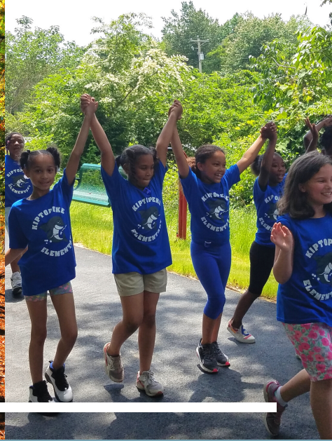
Photos, left to right: Historic railroad, CBES Between the Waters Bike Tour, Kiptopeke Elementary School students at the May 2019 Southern Tip Hike and Bike Trail ribbon cutting.