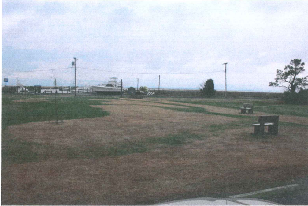
Photograph 3 – Southeastward view of the demonstration garden site prior to installation.