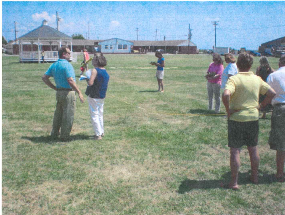
Photograph 1 – Partners collaborating on the planning process during the August 2010 meeting.