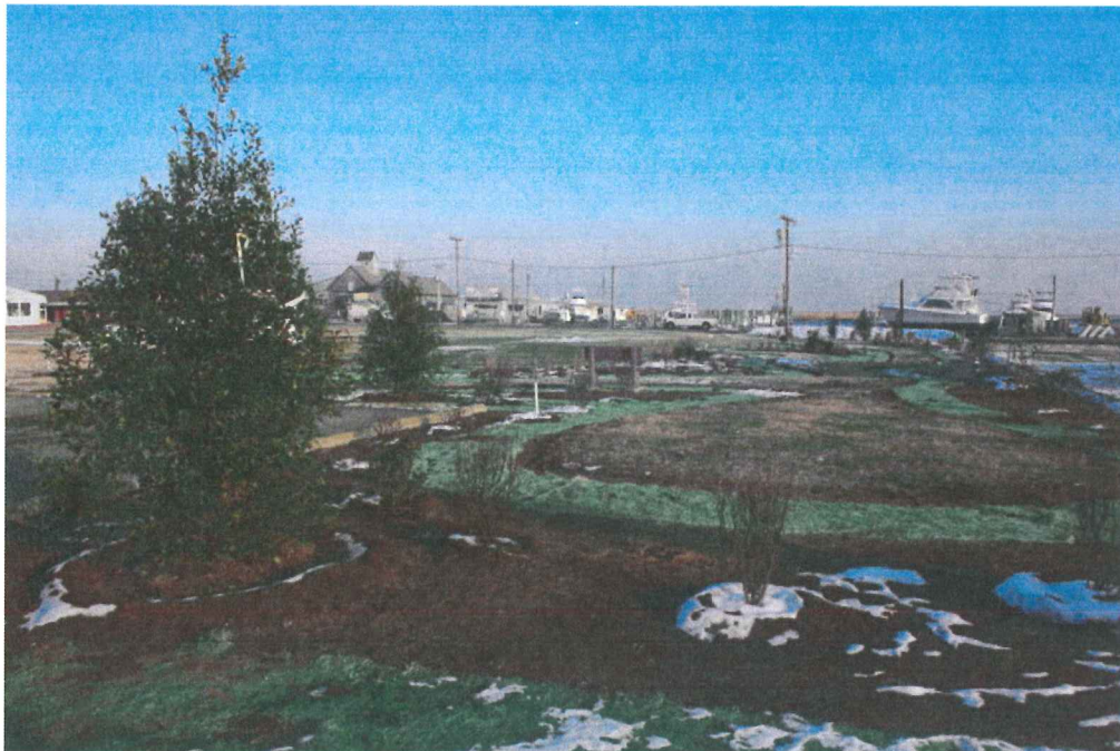
Photograph 8 – Eastward view of demonstration garden during installation.