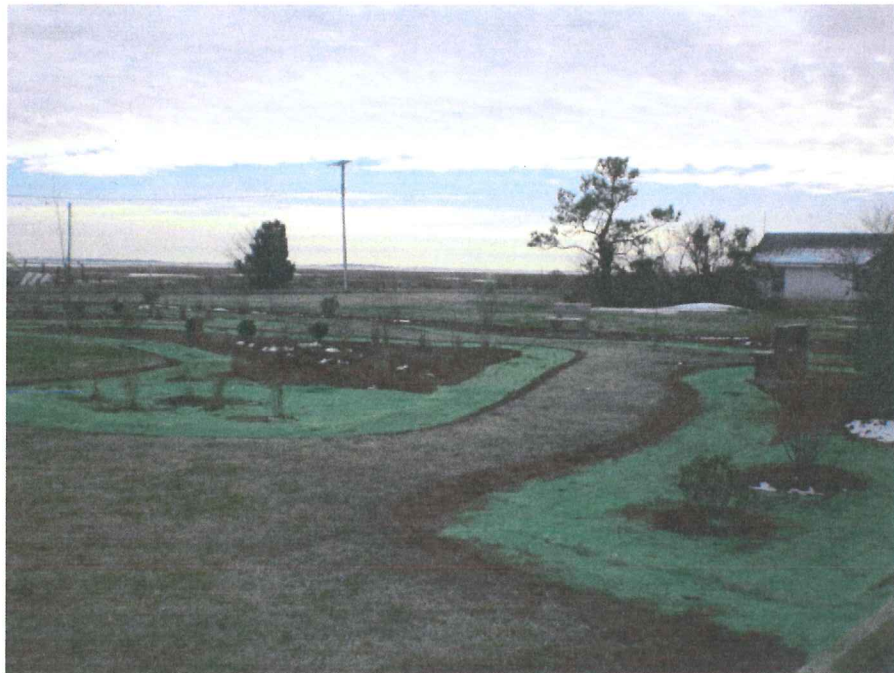
Photograph 10 – Southeastward view of finished demonstration garden.