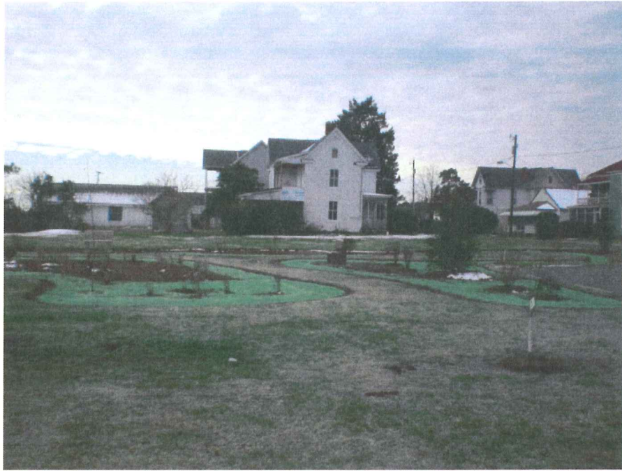
Photograph 11 – Southern view of finished demonstration garden.