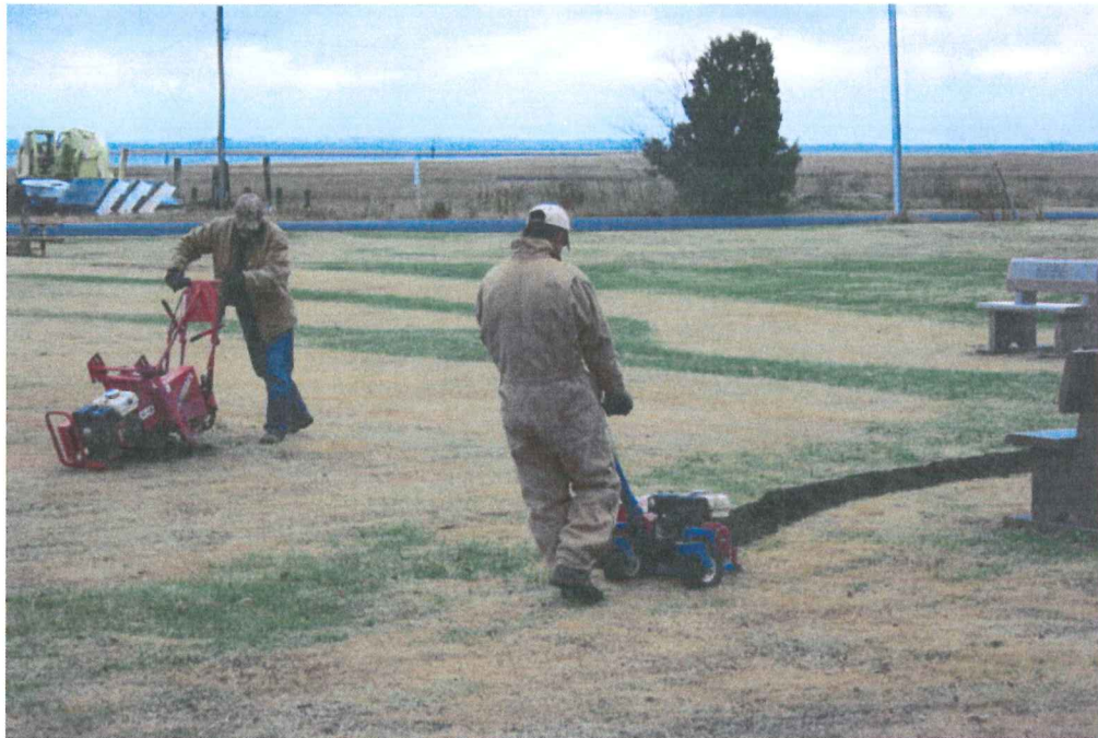
Photograph 4 –Preparation of the planting beds by removal of existing turf.