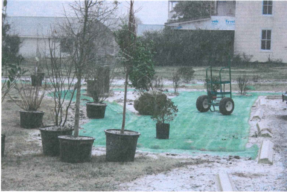
Photograph 7 – Westward view of the demonstration garden during installation.