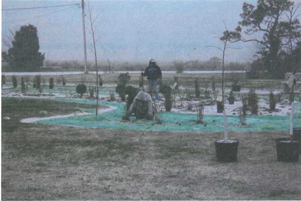
Photograph 5 – Installation of native plants in the planting beds.