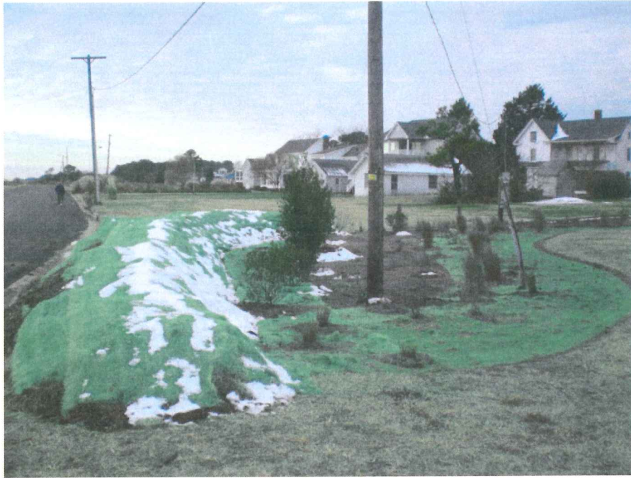
Photograph 15 – Southern view of berm along southeastern corner of garden.