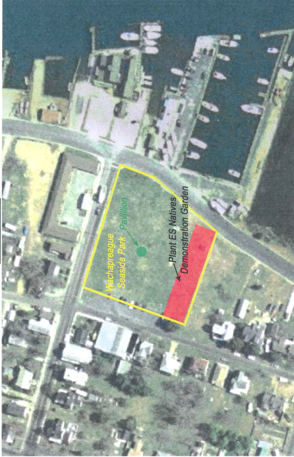
Plant ES Natives Demonstration Garden Wachapreague Seaside Park Wachapreague, Virginia