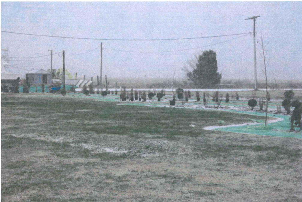
Photograph 6 – Installation of erosion and weed control matting.