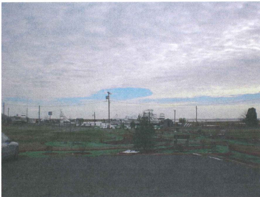
Photograph 18 – Eastern view of demonstration garden from parking lot.