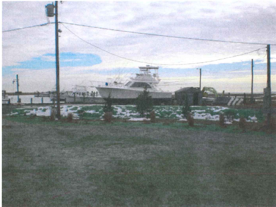
Photograph 14 – Eastern view of berm along southeastern corner of garden.