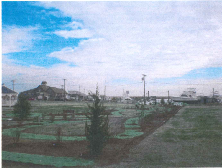
Photograph 17 – Northeastern view of southern boundary of demonstration garden.