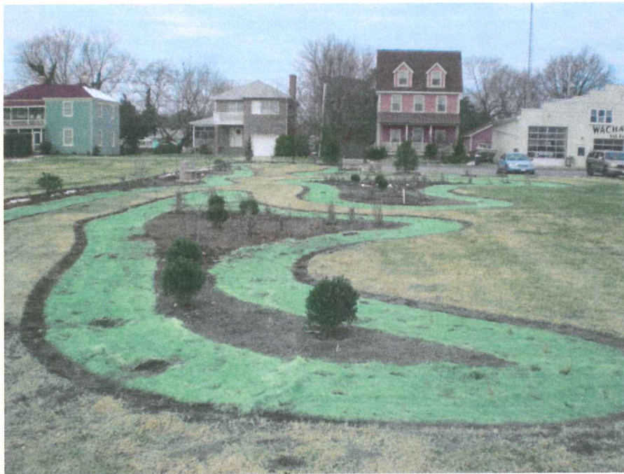
Photograph 16 – Western view of walking paths and planting beds.