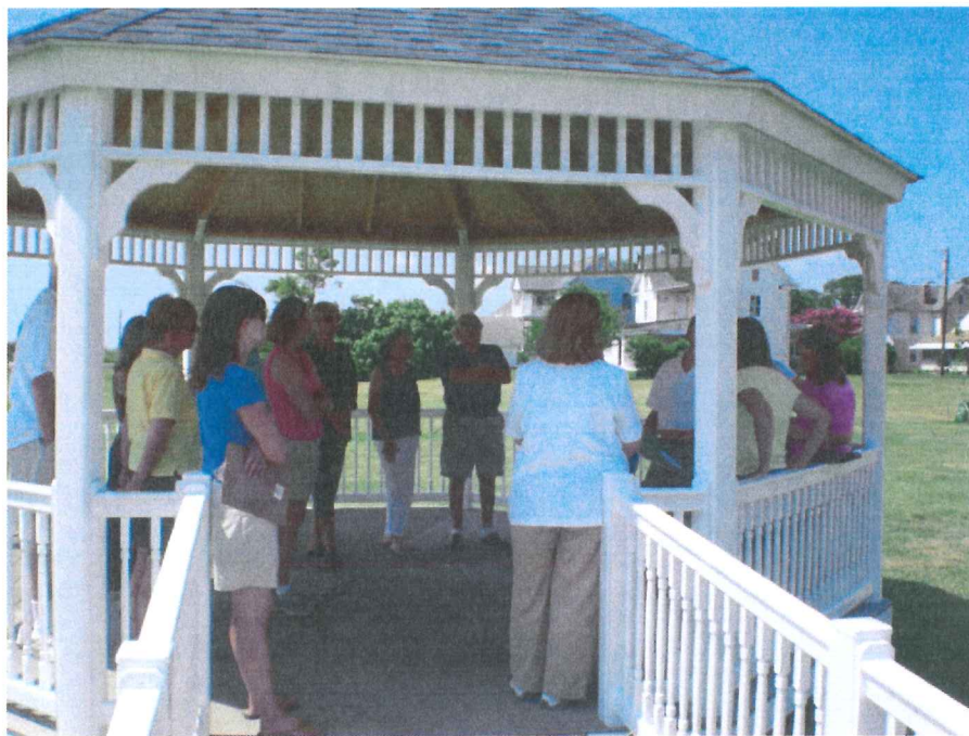
Photograph 2 – Partners collaborating on the planning process during the August 2010 meeting.