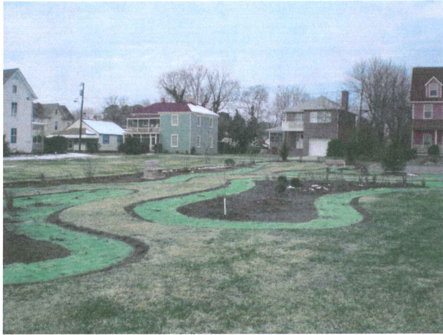
Photograph 13 – Western view of finished demonstration garden.