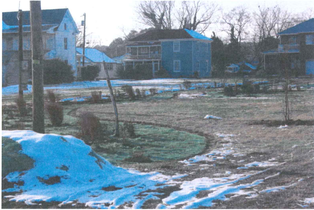
Photograph 9 – Westward view of demonstration garden during installation.