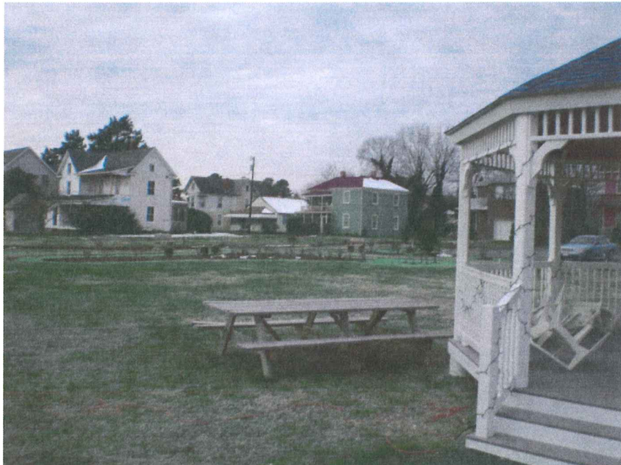
Photograph 12 – Southern view of demonstration garden from gazebo in center of park.