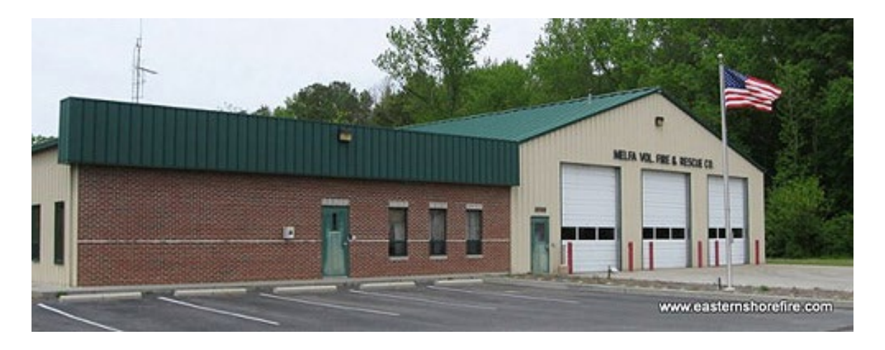
Figure 1: Melfa Volunteer Fire and Rescue Company building on Hatton Avenue includes 3 bays, a community room, bunk rooms, restrooms, station watch room, laundry room, offices, & storage areas.

The Melfa Volunteer Fire and Rescue Company was organized in May 1950 in the aftermath of the "Easter Sunday Fire." Presently, the Fire Company operates a fleet of six apparatus, including two advanced life support ambulances, two engines, a 2,500-gallon tanker, and a brush truck. Additionally, there are three trailers as well as a support/tow vehicle operated by the Hazmat Team and the Eastern Shore C.E.R.T. Disaster Response trailer that are kept on the station's property. The station has three bays and was built in 2002. In addition to serving Melfa, the Melfa Volunteer Fire and Rescue Company serves portions of Bobtown, Boston, Hacks Neck, Harborton, Keller, Texacotown, Savageville, and various outlying areas.